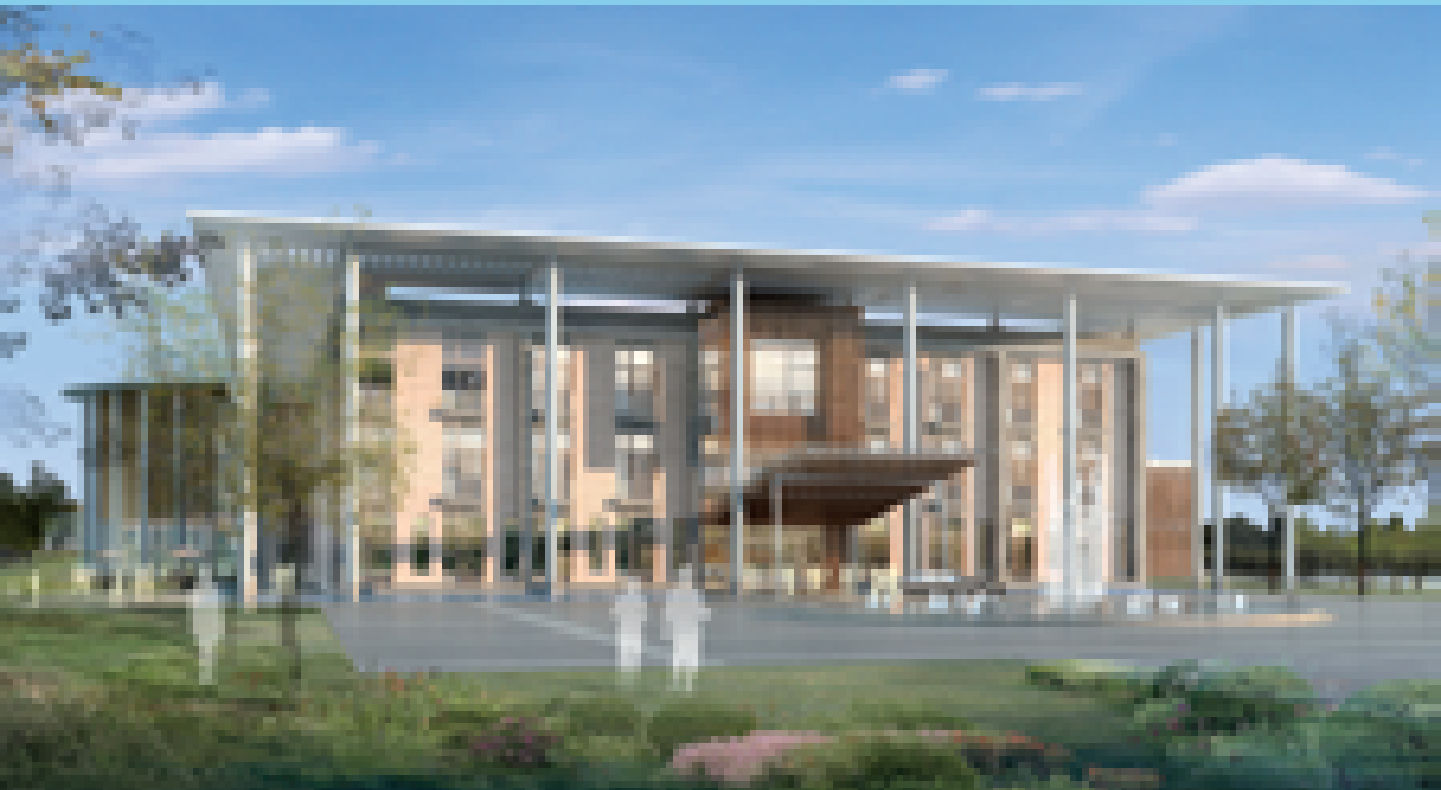
An architect's representation of the upcoming ISB campus at Mohali. The first class at the Mohali campus is scheduled to commence April 2012. Refer page 51 for more details.